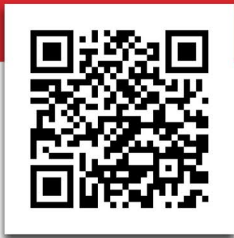
Powermax® system details here!